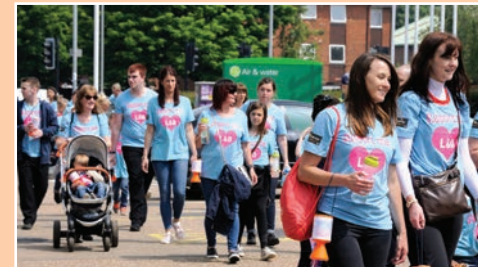
The staff from Sainsbury's in Bramingham and L&D staff joined forces for the Child Oncology Walk, where over 40 people including the Dunstable Rotary Club took part in the walk whilst collecting money along the route. Lots of local business joined in to support the event too.

16 local schools and multiple businesses chose the project as their Charity of the Year and participated in some amazing activities and events.