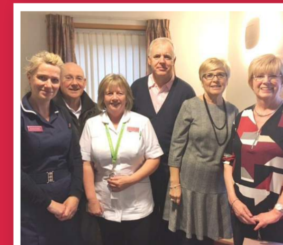
Members of the Duo Fraternitatas lodge visited the Breast Screening Unit and presented a cheque for £430