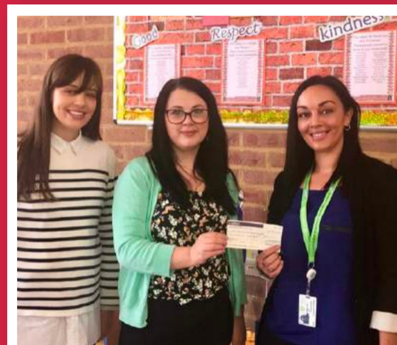
Cheynes Infant School held a toy sale which raised £250 for NICU