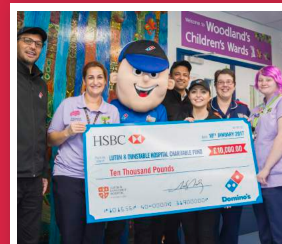
Staff from local Dominos Pizza Stores presented the Children's Ward with a cheque for £10,000 for the Child Oncology Room Project