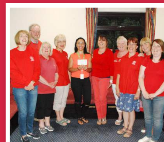
Dunstable and District Orbit Club collected £700 for the Diabetes Centre