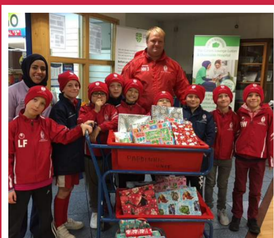
Hamilton FC under 9's gave Christmas presents to the Children's Ward