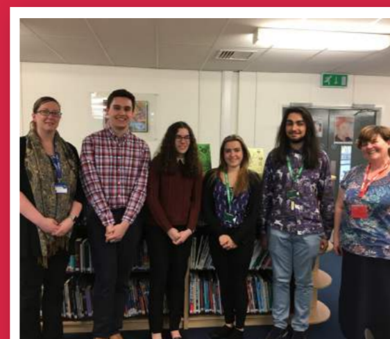
Harlington Sixth Form raised £2000, helped at bucket collections and wrapped Christmas presents.