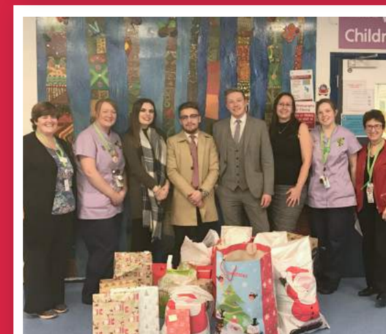
Staff from 3 local branches of Household Estate Agents delivered Christmas presents for our children and elderly patients