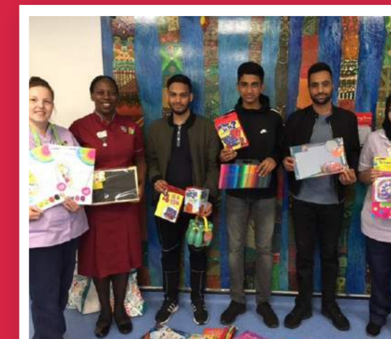
Members of the Ahmaddiya Muslim Youth Organisation kindly donated toys and art equipment to staff in our Children's Wards