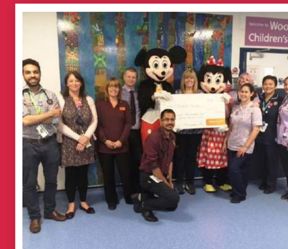
Our Children's Ward was charity of the year at Branningham and Dunstable Sainsbury's.