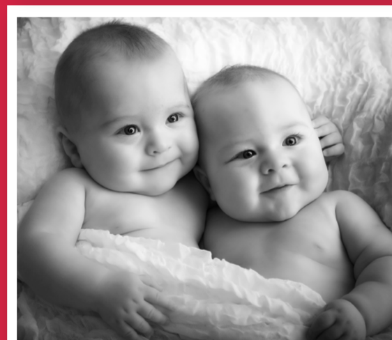
Thanks to Oakley Studios for creating our NICU calendar and raising £1050