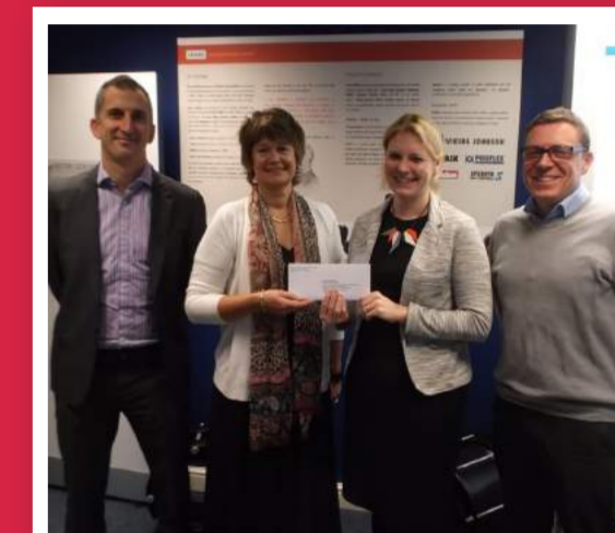
Crane Fund donated $7275 for the Child Oncology Room Project