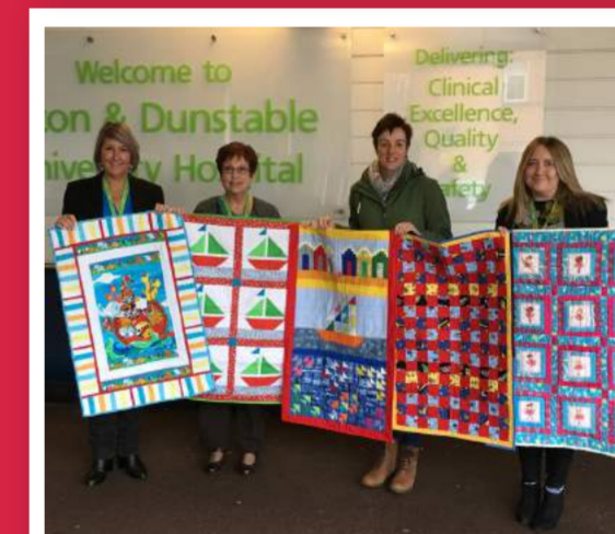
Dunstable Quilters delivered a selection of lovely quilts which had been made under Project Linus for children on the ward